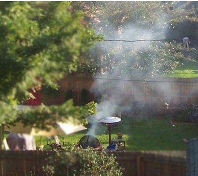
Just one of many examples of illegal burning.

Pennsylvanians emit over 23,000 tons of wood smoke every year, and it's especially bad in the Pittsburgh area. The beautiful valleys and hills trap the pollution, aggravating this problem even further. An estimated 18% of fine particulate matter pollution in Allegheny County is due to wood smoke. One third of all health complaints about air quality are related to wood burning. This is a health hazard that can easily be prevented.