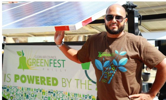
Consolidated Solar's Mobile Solar Generator single-handedly powered last year's festival.

MOM's Organic Market Kid's Corner provides hours of fun and activities for the young and young at heart. You can play the trash dash recycling game and learn about what items go in what bins. Or learn about climate change and how Philadelphia can prepare for a hotter, wetter climate by simulating your own rainstorms and watching how vegetation helps absorb runoff and prevent flooding.