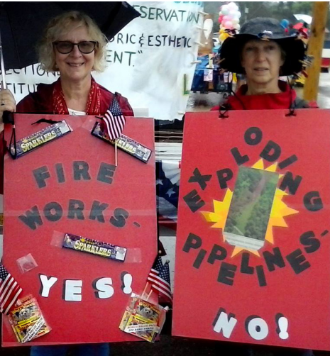
From the annual Millville Firefighters Fourth of July Parade

One of the most common ways to transport fracked gas is to pump it through pipelines. With the fracking boom, local communities in Pennsylvania have become enmeshed in numerous proposals to build new pipelines to transport the fuel throughout the region. In March of 2014, the Williams Company proposed the Atlantic Sunrise Pipeline Project. This pipeline would run 178 miles and carry gas from Pennsylvania to Washington, DC and export facilities in the area.